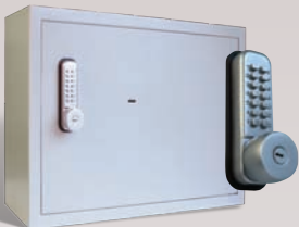
We design special structures for custody of keys